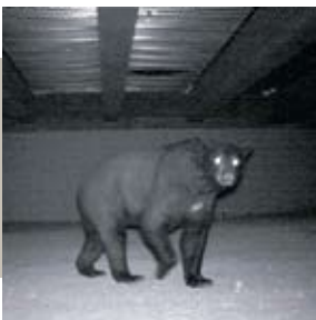
Black bear, Florida