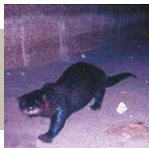
River otter, Florida