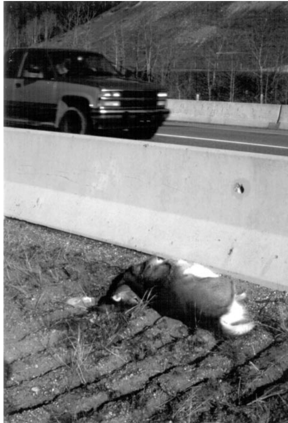
Road-killed deer on Trans-Canada highway in Banff National Park, Alberta.

Few studies have demonstrated that wildlife-vehicle accidents are correlated with traffic volume (McCaffery 1973, Allen and McCullough 1976, Case 1978, Hubbard et al. 2000). Nonetheless, the marked decrease in WVCs along phase 1 and 2 of the TCH after fencing (Figure 2) is convincing evidence that fencing can be an effective measure to reduce WVCs. Although the sample size was small, this pattern held for phase 3A. Fencing's effectiveness in reducing WVCs is illustrated by Royal Canadian Mounted Police accident data for the Banff (fenced) and Canmore (unfenced) sections of the TCH from 1995 to 1997 (Table 1). These 2 sections are adjacent and span 81 km. Wildlife-vehicle collision rates were 4 times greater on unfenced sections compared to fenced. On average, more than half of all accidents on unfenced sections were wildlife-related. The results are compelling, but nonetheless should be interpreted with caution