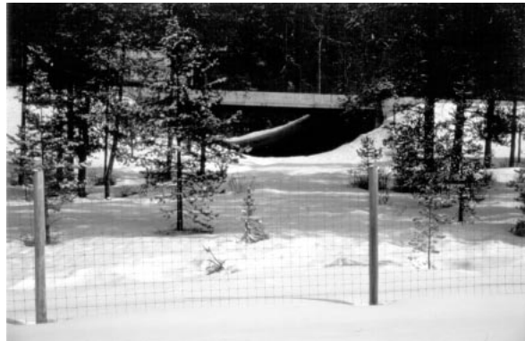
Highway mitigation fencing and wildlife underpass in Banff National Park, Alberta.