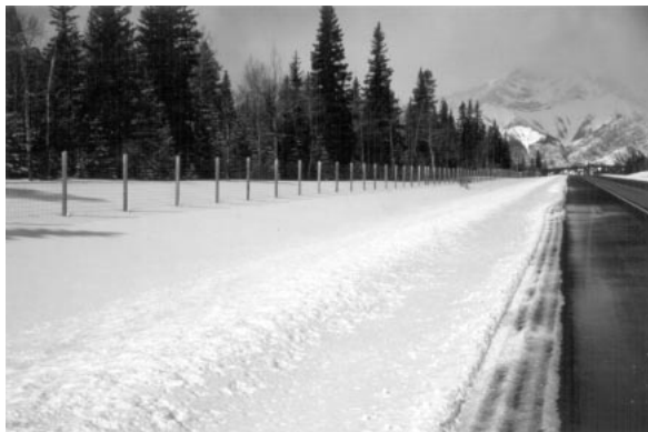
Trans-Canada highway mitigation fencing in Banff National Park, Alberta.

The 2-km road segment centered at fence ends had the highest accident rate, and frequency of WVCs tapered off with increasing distance on both sides. Fenced rights-of-way are attractive to herbivores and predators, with greater forage for grazing, greater densities of small mammals, salt, carrion, etc. (Groot Bruinderink and Hazebroek 1996; A. P. Clevenger, unpublished data). Wildlife often access rights-of-way and travel inside fenced areas. Wildlife entering fenced rights-of-way from fence ends can become trapped and likely more prone to be hit by